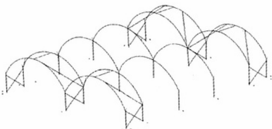
Perspective view without plastic covering

Engineered for berries, tomatoes, nurseries, and other speciality crops, providing reliable protection and improved growing conditions.